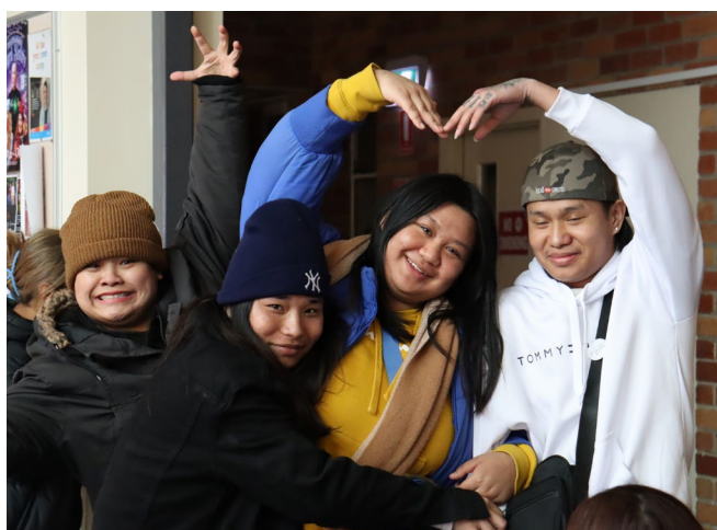
Creating connections was central to the 2023 Little Things Project.

At the launch, young people had the chance to connect with guest advocates and learn about local health services, including headspace. After the formalities, an intercultural evening, including team-building games and dinner, gave young people from the region the chance to connect in a safe and inclusive space.