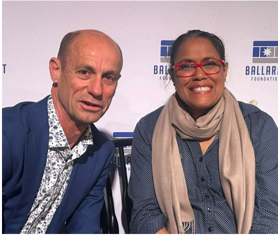
Steve Moneghetti and Cathy Freeman