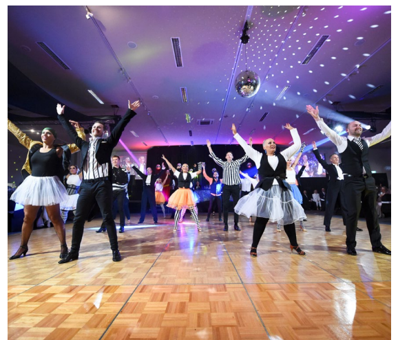
The 2023 Stars raised more than $186,000.