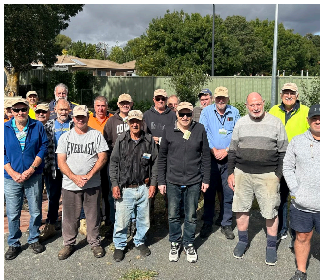
The Sebastopol Men's Shed supports daily activities to connect and engage community members.