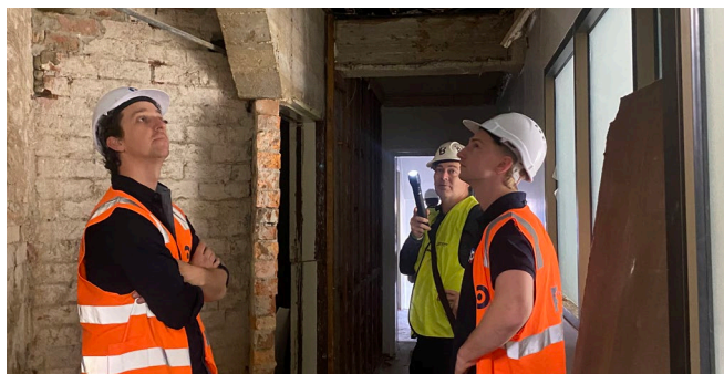
Construction work is underway at the Ballarat Foundation Giving Hub in Lydiard St.