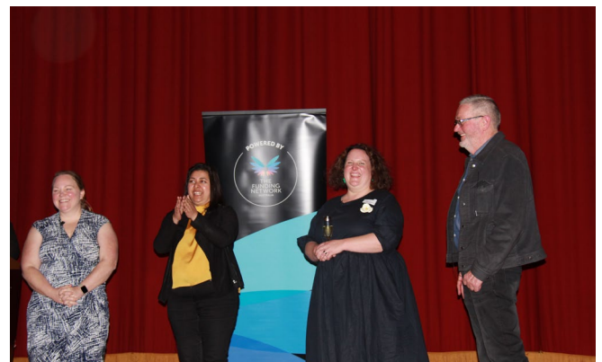
Pitch Up event

Supported by event partners The Funding Network, dozens of community members raised their hands in support of the project which “pitched” proposals for support to the audience.