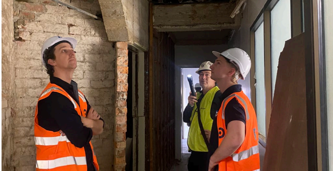
Construction work is underway at the Ballarat Foundation Giving Hub in Lydiard St.