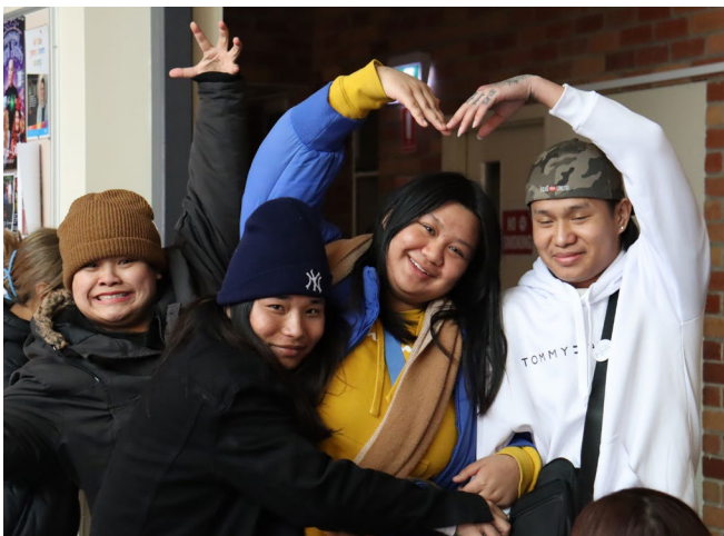
Creating connections was central to the 2023 Little Things Project.

At the launch, young people had the chance to connect with guest advocates and learn about local health services, including headspace. After the formalities, an intercultural evening, including team-building games and dinner, gave young people from the region the chance to connect in a safe and inclusive space.