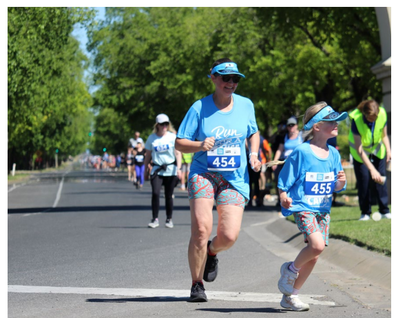
More than 800 people lined up for Run for a Cause