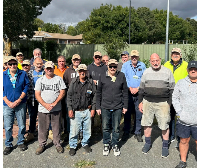
The Sebastopol Men's Shed supports daily activities to connect and engage community members.