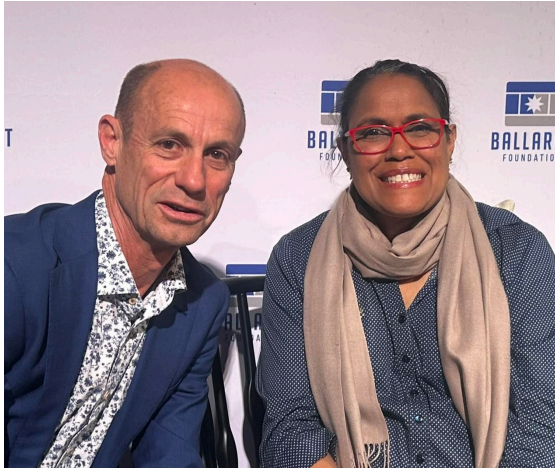
Steve Moneghetti and Cathy Freeman